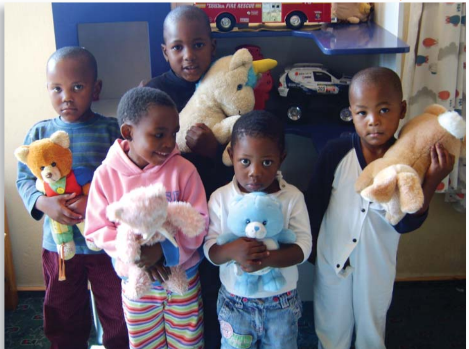
The generosity of friends like you has ensured that our Kiddios Cottage will soon be revamped for our little ones.

We'll keep you updated of progress through our website – and will feature the revamp in the next newsletter.