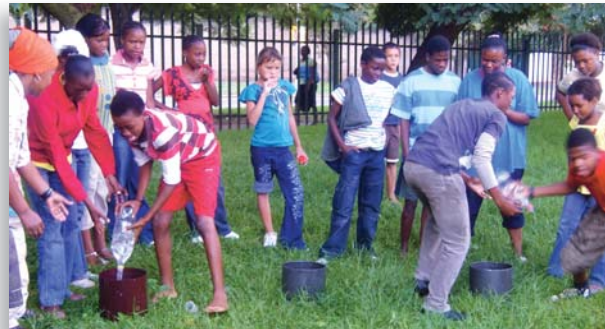
Filling up buckets by using punctured two-litre bottles ... not easy!