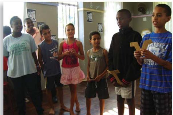
Children from Cottage 4 during their presentation ... and below, excited prize-winners.

Thank you to all the children for their excellent work – and to the sponsors of our prizes.