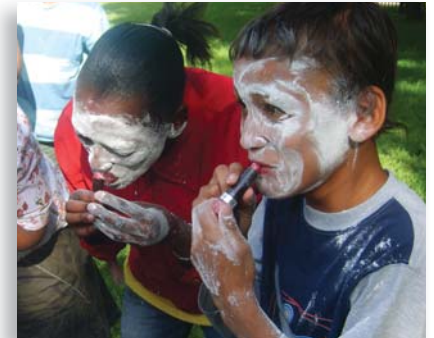
Our boys gladly plastered their faces with lipstick – in the interests of winning, of course!