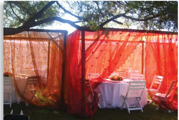
Below: the spectacular outdoor brunch setting.

We extend grateful thanks to Roxanne and to everyone who helped to give our girls this extra-special experience.