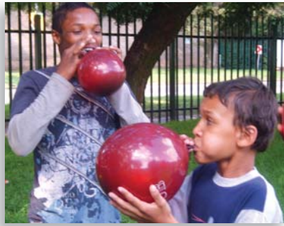
Blowing up balloons was never this much fun!

The event was a great success and – as you can see from the photos – led to loads of laughter!