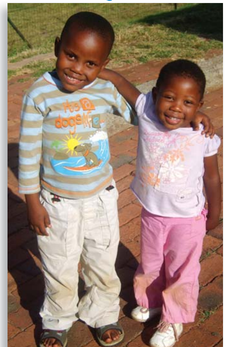
Two of our tiny tots were happy to hold their pose – and their ready smiles – for the camera.