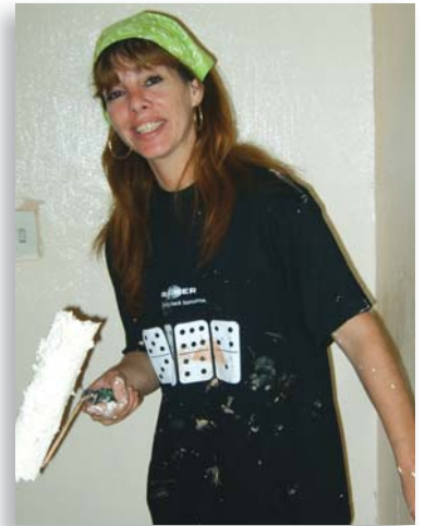
Volunteers from Tracker painted our children's gym area with much enthusiasm. Thank you to the cheerful Tracker team.