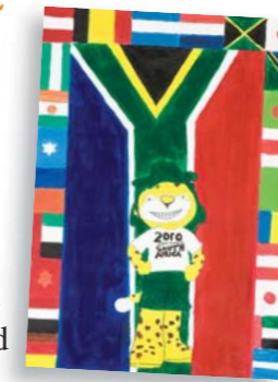
An example of our girls' and boys' fabulous art!

Please join us on 27 – 29 May this year for the annual Art Exhibition and Open day.