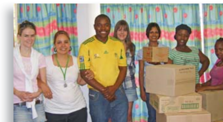
The Director and Grandmark staff with some of the boxes of stationery they sponsored.

They've been supporting us for many years, and there's always a buzz of excitement when their gifts arrive!