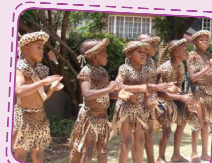
Below right: the boys strut their stuff on stage in their traditional outfits.