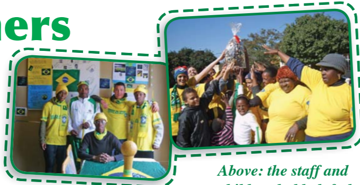
Above: the Stepping Stones boys' cottage stand together decorated in Brazil's colours.

The children challenged the staff to a game of soccer and it was a close call ... The staff had to bend