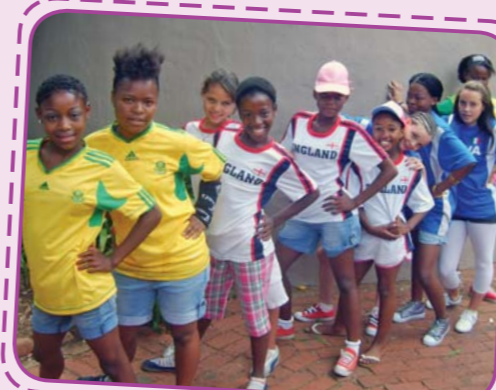
Left: the girls model their soccer supporter gear.